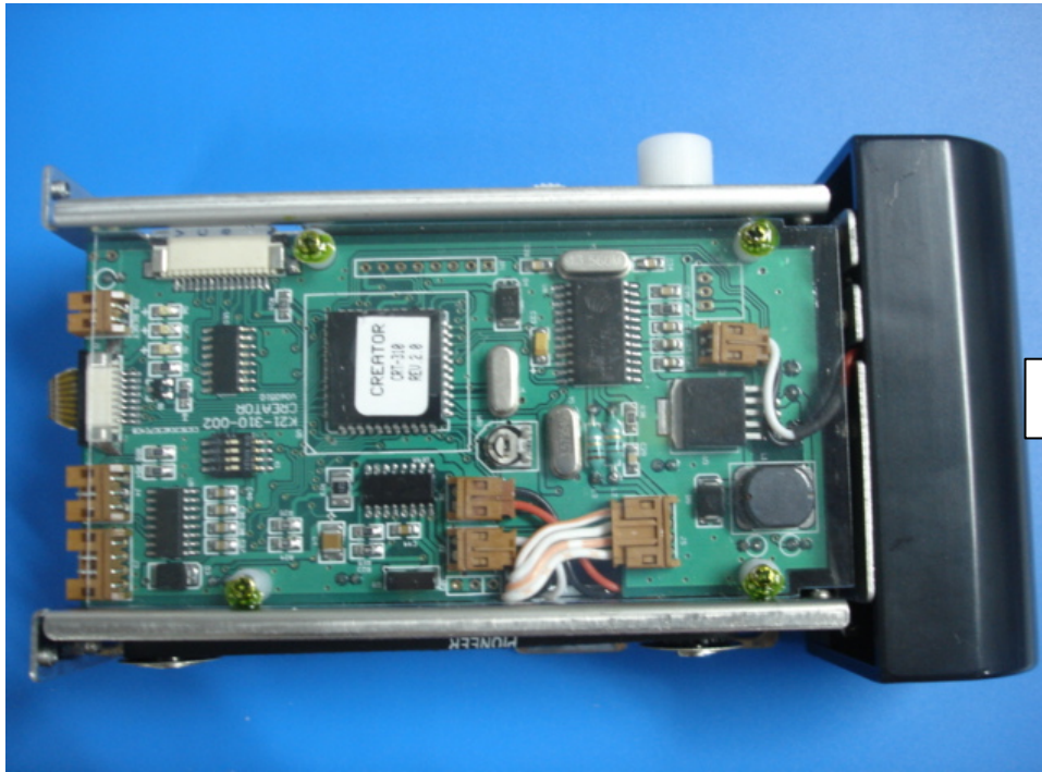
The body machine